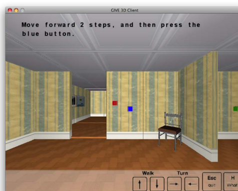
Figure 1: The GIVE Challenge.

GIVE (“Generating Instructions in Virtual Environments”) (Koller et al., 2007) is a research challenge for the NLG community designed to provide a new approach to NLG system evaluation. In the GIVE scenario, users try to solve a treasure hunt in a virtual 3D world that they have not seen before. The computer has a complete symbolic representation of the virtual environment. The challenge for the NLG system is to generate, in real time, natural-language instructions that will guide the users to the successful completion of their task (see Fig. 1). One crucial advantage of this generation task is that the NLG system and the user can be physically separated. This makes it possible to carry out a task-based evaluation over the Internet – an approach that has been shown to provide generous amounts