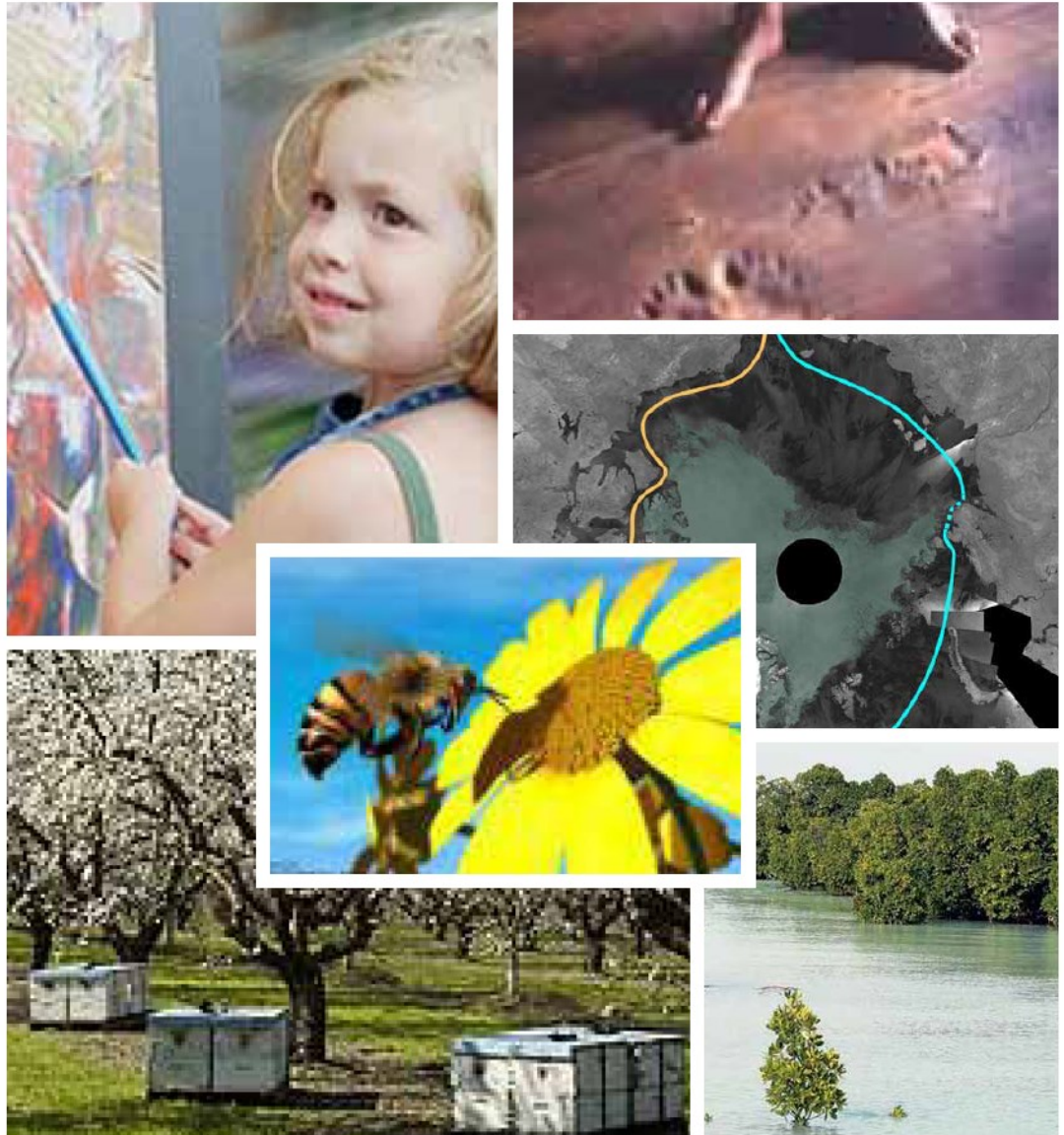
World scenes of life today; bees and flowers, child painting, global warming floods, the ozone hole

affirms the importance of creativity and imagination along with science, this is perhaps why the section is closed by an anonymous poem called 'community', reflecting on both the need for human community and the beauty of nature 94 .