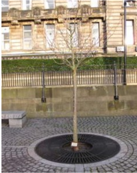
Image: tree planted outside St Mungo's Museum in Glasgow in honour of the centenary of the SIFC in SIFC March 2010: p10

The tree acts as a reminder to Scotland's diverse faith communities of the need to be unified in their common goal of living and working for the good of Scotland 99 .