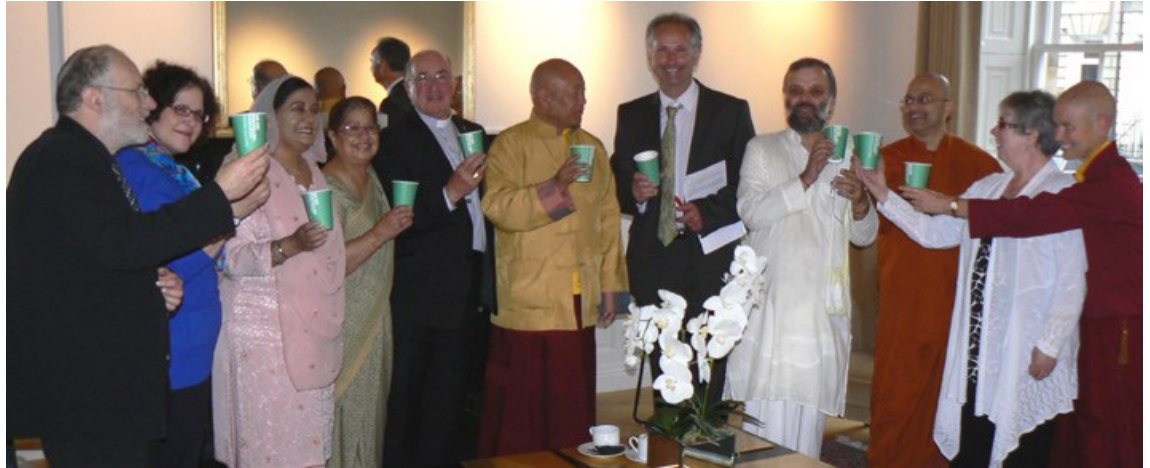
Image: Scottish Religious Leaders 'raise a cup' for McMillan Cancer Supports 'World's Biggest Coffee Morning' SIFC August 2011: p1

government would have every reason to promote groups which reinforce values aligning with their interests, just as religious involvement in charitable work helps to tackle the kind of social issues which can threaten their legitimacy.