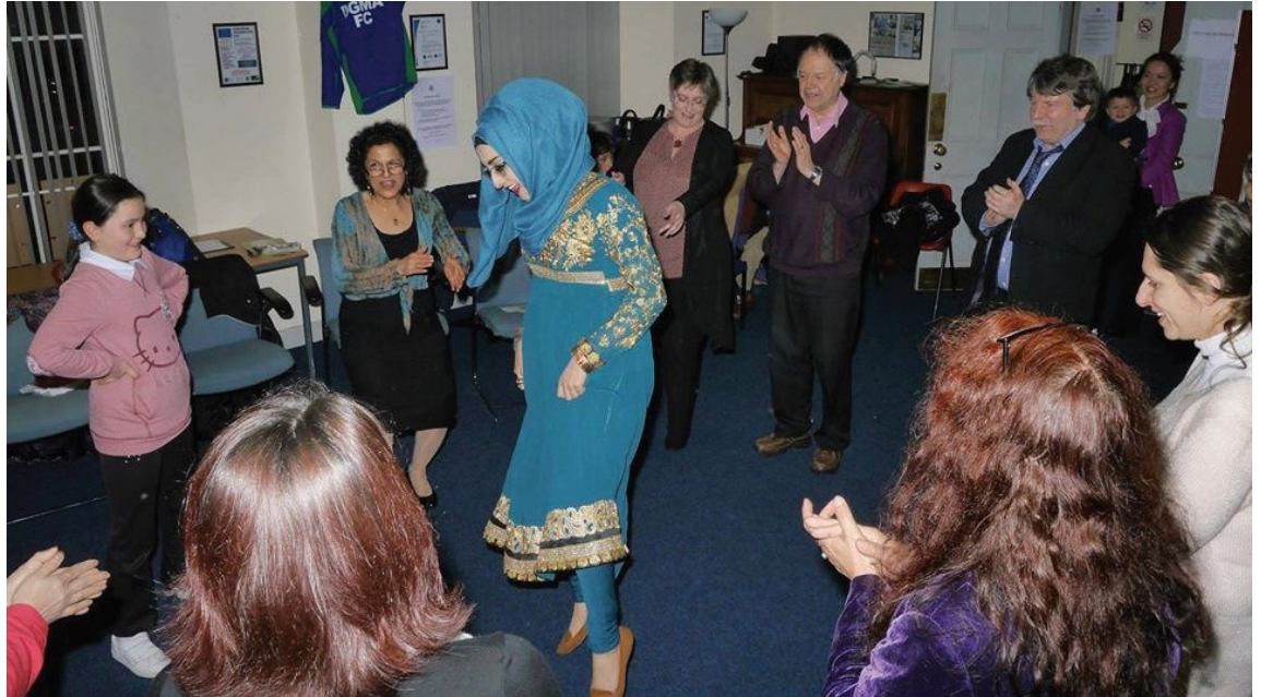
Image: Scottish traditional dancing at Dumfries and Galloway ‘Curry and Ceilidh’ event held on the 26 th of November 2014 from IFS Spring 2015: p9

examples of ‘Scots-Indian fusion dance’ and ‘curry and ceilidh’ events, along with Burns Suppers 31 and frequent uses of the poetry of Robert Burns 32 .