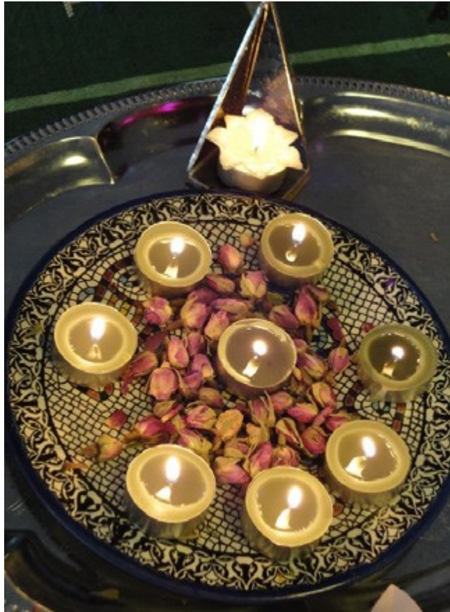
Image: 'The Seven Candles of Unity' from Bahá'í New Year celebrations attended by representatives of many religious communities in Dumfries in SIFC August 2011: p13

These ethnic cultural elements, symbolism and histories are part and parcel of the ways in which some communities are incorporated but it is the universalistic, intellectual, ethical and textual elements which are brought to the fore. Despite the ethnic ties of all the religious communities represented in the literature, which in some cases were very evident, they are primarily represented as religions not ethnicities, which is most strikingly exemplified by the Guide which does not discuss the ethnic elements of Judaism, or even mention India in relation to Hinduism (though other documents do).