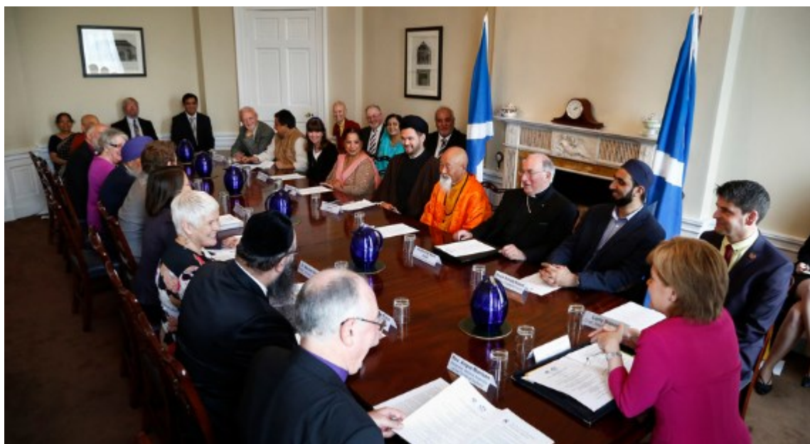
Image: The Religious Leaders Forum meeting with First Minister Nicola Sturgeon in 2015, available at: http://www.interfaithscotland.org/news/news-archive-2015/ (last accessed 17/5/2018)