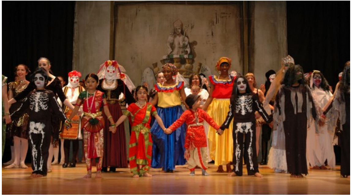
Image: children in multicultural festival costumes at an International Women's Day Celebration in Glasgow in 2010

However, while IFS is concerned with religious groups, the ways in which these religious traditions are intertwined with immigrant ethnic heritage in Scotland has meant that these become part and parcel of the ways in which they are represented. The Muslim population is largely made up of Pakistani communities, one Muslim IFS member being the Pakistan Association Edinburgh and East Scotland 89 , though with other Muslim immigrant communities and some converts 90 . The Sikh community is overwhelmingly of Punjabi descent 91 , while the Hindu community is composed of different Indian communities with some non-Indian converts to groups like the International Society for Krishna Consciousness (ISKCON or 'Hare Krishnas') 92 . The two Hindu members of IFS are the Glasgow Hindu Mandir (GHM) and the Hindu Temple of Scotland (HTS), also in