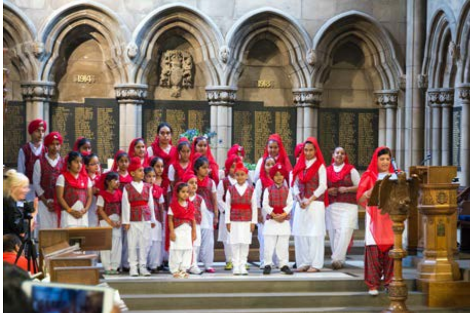
Image: tartan clad Sikh children’s choir at opening of Commonwealth Games in Glasgow 2014 in IFS Summer 2014: p10

the IFS organised interfaith service of welcome held before the Games featured a Sikh children’s choir clad in tartan outfits 117 . Though more ordinary developments within religious minority communities such as their growth, development and entrenchment in Scottish cities can be given national rather than simply local or communal significance.