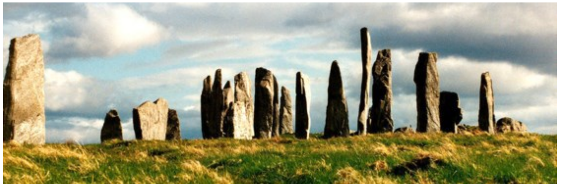
Image: photograph of Callanish standing stones on the Isle of Lewis taken from the Pagan section of The Guide p21

The embeddedness of those Christian sites such as Iona in the Scottish cultural landscape and their incorporation into a religiously pluralist sacred landscape can be achieved by embedding minority sites alongside them, for example, Tibetan Buddhist community's purpose-built monastery of Samyé Ling in Eskdalemuir and Holy Isle, which is owned by the same community. Like Iona, these Buddhist sites have become popular destinations for interfaith pilgrimages, providing an opportunity to “learn about the unique contribution of Tibetan Buddhism to Scotland’s religious landscape 122 .” This even has a pre-Christian dimension with Neolithic sites such as the standing stones of Callanish in Lewis, it is a mark of the increasing recognition of the Pagan community that their ties to these sites are acknowledged, being used to symbolise their religion in the Guide 123 .