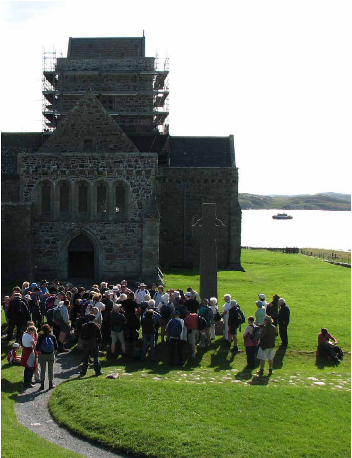
Image: Iona Abbey with a Celtic cross in the foreground, placed at the beginning of the Christian section of Values : p28