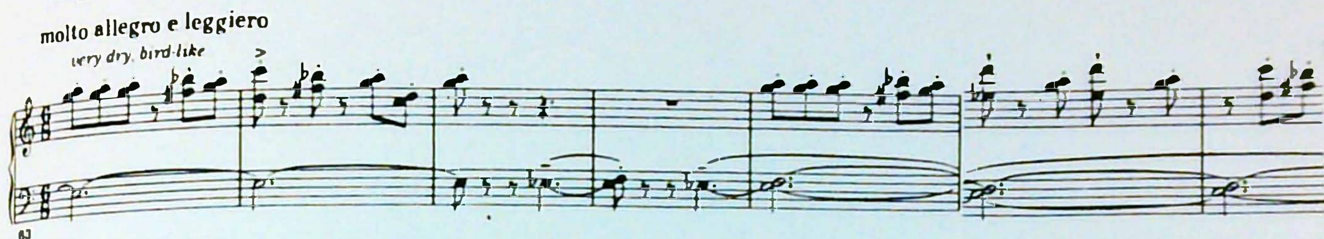
fig. 18: 'Awake my Glory'

chords, centered initially on Eb, and moving up to F as a 2-bar ostinato figure is established (bars 80-93).