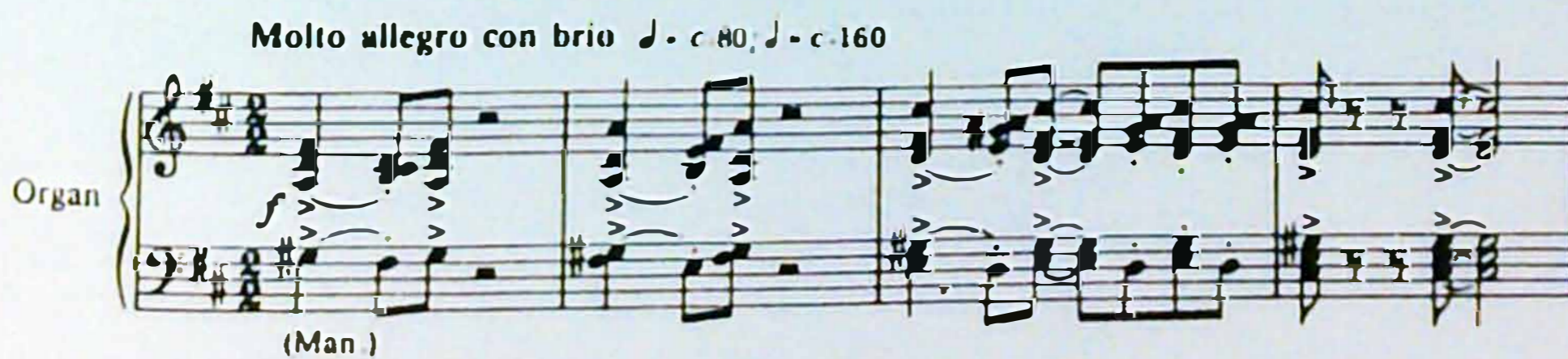
fig. 12: 'The Sarum Mass' - Gloria

The ending, predictably perhaps for a 'Three Choirs' Gloria, is huge. The build begins on page 12 ('you take away the sin of the world'), and the dynamics never fall below 'f' in the final 52 bars of the movement. Much development is made of the opening rhythmic figure (see 'you alone are the Lord', 'Jesus Christ', 'Holy Spirit', and 'in the glory'). Leighton perhaps overindulges a little in the last phrase, where the words 'in the glory' are heard 17 separate times, the penultimate time fitting the words 'in the glory, glory, glory, glory' to the rhythmic figure! This, together with the final D major added sixth chord, points perhaps to Leighton's light-hearted interpretation of the 'new' text. It is interesting to note the comparison between the 'Gloria' rhythmic figure, and one from the final movement of the 'SEQUENCE FOR ALL SAINTS' (1977). (fig 13).