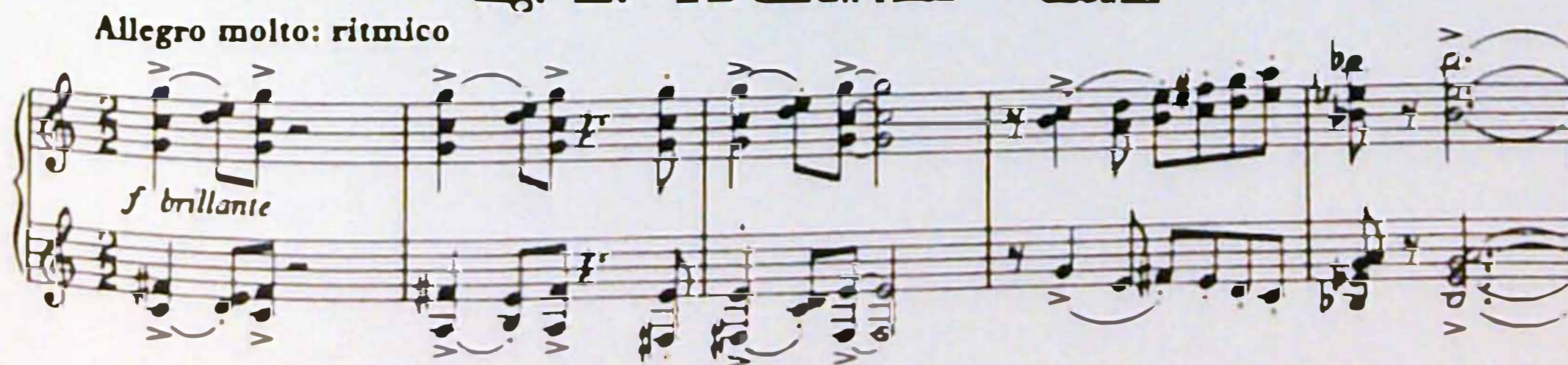
fig. 13: 'Sequence for All Saints' - Finale