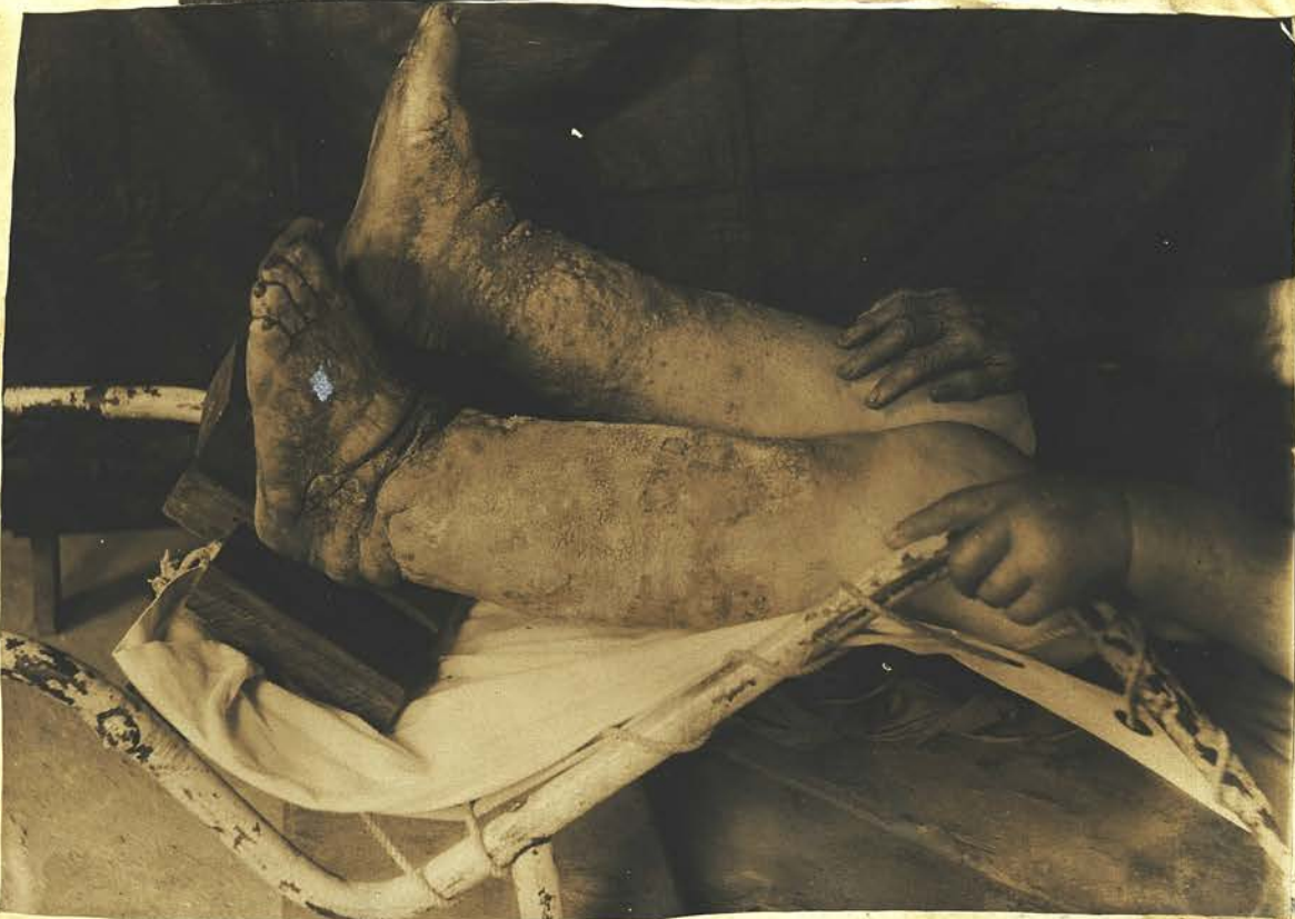
and died from the hospital, one man, a Portuguese, died.

containing a prescription pro operating I and slightly as possible. - Be applied below Symptoms were recorded the knee to the the knee to the the knee to the possible, the possible and the with strong excit vegetic I was think long propert hair locking wound erit to pres in