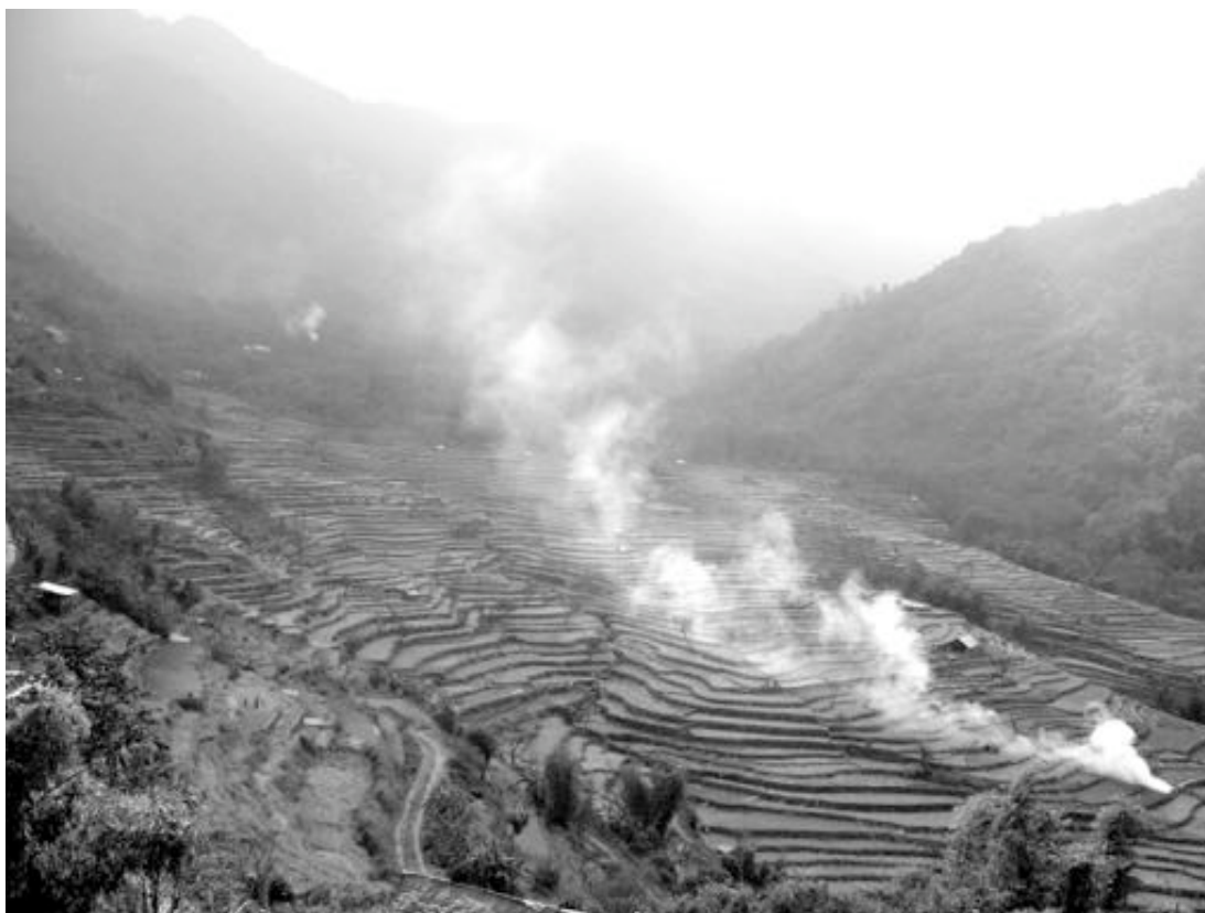
Figure 8. Terraced paddy fields below Khonoma village

By taking into account dreamscapes, we have a better understanding of how the Angami negotiate space. A simple example is that physical boundaries to physical space are set as much by spirits (or spiritual influence) as they are by physical features, or clan (i.e. men) decision. In the previous chapter I discussed the ways in which the community receives and interprets spirit messages in dreams, and in charismatic Christian worship, and how this interpretive process involves 'interference', entailing the social 'regulation' of spirit knowledge in order that it may be integrated into community life while avoiding any unwelcome 'disruption'. I also traced 'interference' to pre-Christian practices associated with ritual spirit propitiation. Village founders and heads, the Kemovos , negotiated with the original spirit owners of the land, and in this process delineated where the domain of the living ended, and where the domain of spirits began. This practice influenced clan ideas of space and how, partly due to concern for preserving the contiguity of lineage property, it is a practice that remains, though the original settlement perimeter has