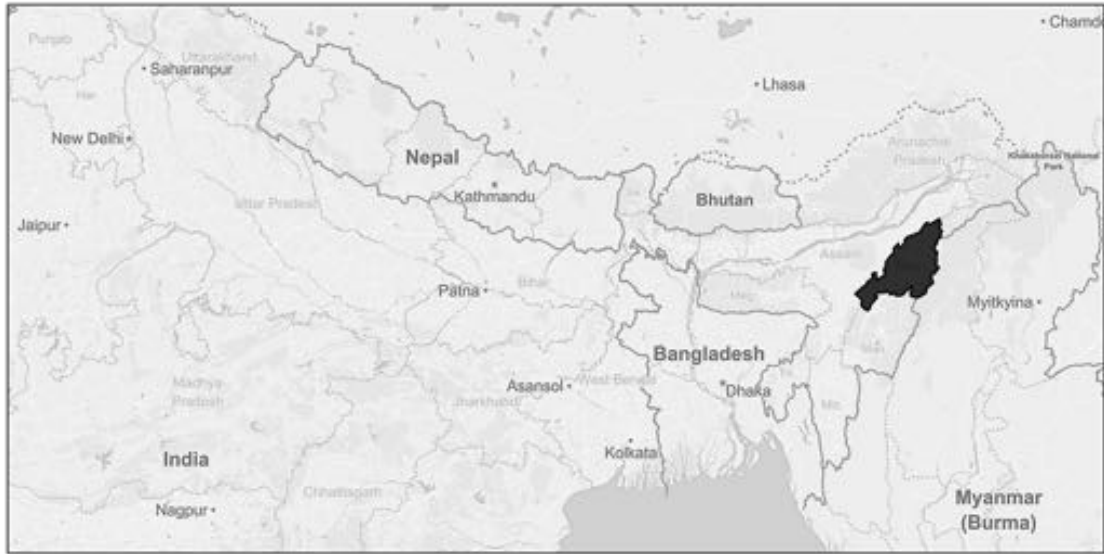
Figure 1. Map of Nagaland state in the India-Mynamar borderlands (Author’s drawing).

dialects. Kohima is considered ‘Northern’ Angami, and is home to the ‘official’ Tenyidie dialect used in educational curriculums and publications. 5