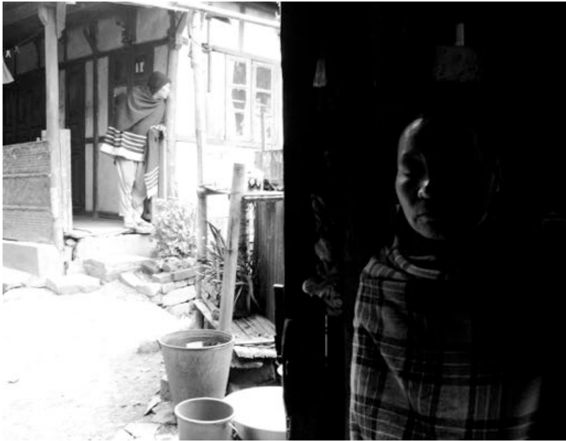
Figure 5. Dreaming in Kohima village.

The incidents described by my informants in the previous chapter were interpreted in many ways as partial messages from the supernatural realm, affording only oblique views through an otherwise all-concealing veil. Behind this veil, there was presumably a fuller knowledge of the immanent event, that if it was clearer, better understood, perhaps the tragedy could have been avoided. There are individuals, however, that do in a sense breach this divide. Having developed a few underpinning general principles towards an Angami 'science of dreams', namely the function of 'reversibility' as grounded in the continuum - across sleeping and waking states - of the always perceiving and experiencing ruopfü , I now turn to exploring the experiences of 'specialists'. Central to this discussion is the possibility of conceiving ruopfü as not inseparable in some way or formed from the human body. Linkages between certain kinds of dream experiences such as flight, and the disembodied soul or spirit described in human animal transformation or therianthropy has been only of