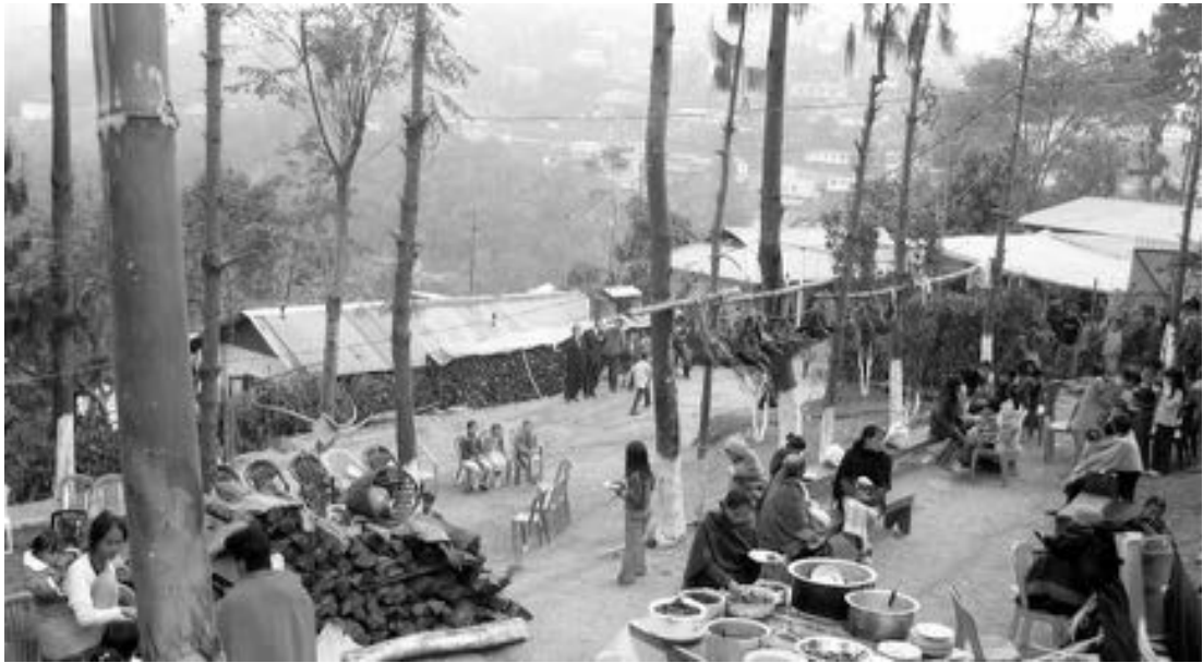
Figure 4. Meya Clan Feast.

In this thesis, I interpret Hutton's insights regarding an Angami dreaming, namely that 'Of all forms of second sight dreaming is the favourite and the best. The Angamis have almost a science of dreaming' (Hutton 1921a, p.246), as an injunction, and in this chapter I sketch out a preliminary study of the cultural system of Angami dreams and dreaming. In the introduction I discussed the idea that dreams and dreaming for the Angami are recognised as central themes in the folklore, and as integral forms of knowledge. They are generally acknowledged as the preferred means for divining the outcome of important life events as well as day to day decisions and economic exchanges. I also explained that despite the spread and changes brought about by Christianity, little has changed in regards to the importance dreams are given, and dreams and dreaming have transcended the domestic and public spaces of the clan.