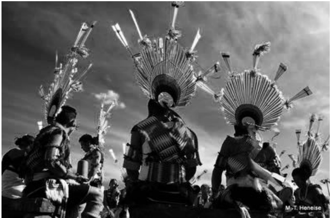
Figure 7. Angami Clan men in full ceremonial dress.

The Meya clan, as with the other clans in L-khel , finds ways to maintain a sense of unity despite the fact that its five lineages are more or less scattered, within the larger L-khel vicinity, and beyond the village boundary. The growth of Kohima town, and the myriad roads and national highway below have obscured what are traditionally the L-khel lands and paddy fields, all stretching to the north and northwest of the village. Clan unity in the absence of residential congruity, was once achieved through combined community rituals organised by the lineage elders. But the few ritual practices that remain are mere re-enactments, having shed their original magico-religious purposes – an eligibility requirement for church membership. The old men meet more often, to discuss the ever-present problem of land encroachment, or perhaps to agree on a common law marriage in the case of a teen pregnancy. Occasionally, clan meetings involving women and children are organised to rekindle ties, and in chapter 2 I detailed the occasion of a gathering in a forest clearing, in which the preservation of lineage lands, and thus the unity of the Meya clan was