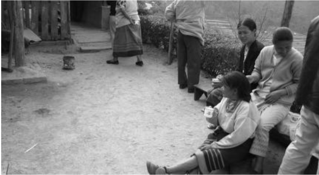
Figure 3. Morning sharing.

Dreams ( mho ) are routinely shared in close family gatherings, around kitchen hearths in the morning hours, or among close neighbours while engaged in household chores in the clan neighbourhood. They are generally interpreted as experiences of the 'self', a term closely associated with the person's soul or spirit, namely ruopfü . Thus, dreaming and waking states are equally understood as modes of experiencing the world, and thus are experiences of the ruopfü , thereby problematizing the assumed suspension of perception or experience of the world in sleep. These diverse understandings can help us navigate the world of Angami dreaming that is interpreted by the people according to the context of the dream experience. First, dreaming is closely associated with ancestral and spirit-mediated knowledge. Properly interpreted, dreams offer glimpses into a privileged form of knowledge where eventualities, often concealed in signs, are both perceivable and negotiable through various devices of daytime 'interference', such as sharing the dream publically, getting a dream blessed by an elder, or seeking intercessory prayer at a local church or prayer centre. Second, dreams reveal specific information about a particular situation, but in oblique ways, and there are individuals in the community, who are particularly gifted at deciphering oblique messages. Unlike the 'external'