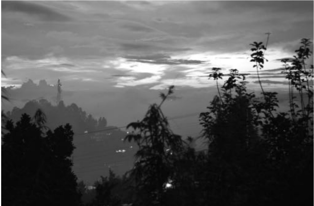
Figure 11. View from fieldwork residence in Kohima village (Author's photo).

This ethnographic study set out to explore the relationship between dreams and agency among the Angami Nagas in Northeast India, and identifies in the Angami concept of ruopfü – one’s spirit or soul – a continuity of consciousness between waking and dreaming states expressed in Angami personhood, enabling the inhabitation of both spaces simultaneously, thus allowing for their ‘reversibility’. Situated within a clan community in Kohima village, in Nagaland state, this project follows the ordinary and extraordinary dream experiences of ordinary and gifted men, women, and young people, as expressed in both narrated dream sequences, and their interpretations, often by close kin, but also elders, and occasionally church prayer counsellors. Most conversations occur in typical settings around kitchen hearths, in which I also participate in dream sharing, and become inculcated into the great collective effort to cull insights from dream-mediated knowledge and waketime omens, or what in this thesis I call the ‘interpretive community’. The political situation was not an immediate concern as the focus of the study was generally situated within the broad perimeters of the L-khel clan group, and even broader